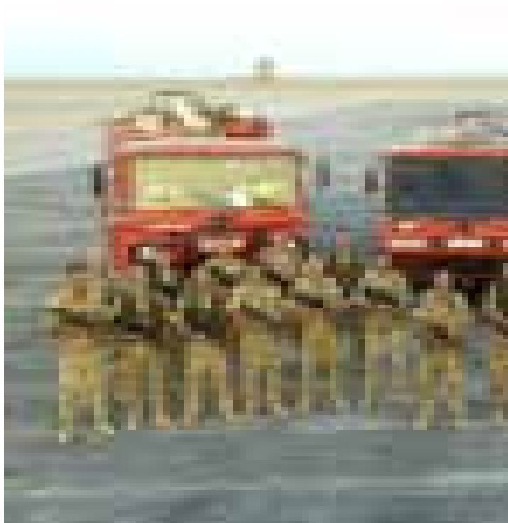
ABOVE - RAF FIREFIGHTING AND RES

In all the fire-fighters are carrying out a major assignment and showing the Royal Air Force in a fine light. A huge pat on the back must be given to the young men that are completely dedicated to a mammoth undertaking.