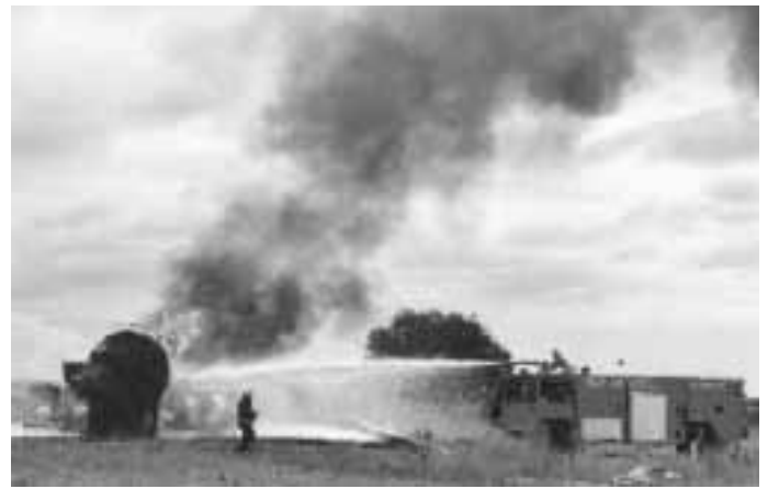
RAF Coningsby fireground demo using Training Module and Liquefied Petroleum Gas (LPG) on a simulated aircraft crash rescue exercise using light water foam via the monitor on the Alvis Rapid Intervention Vehicle (RIV) - Sunday 25 June 2000.

When you see the way uniform, equipment, tech-nology and appliances have developed since then, it seems a very different job today. But