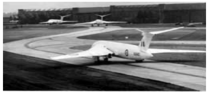
Victor V Bombers taxying Cottesmore

We all returned to NZ in 1976, with me attending the RNZAF Staff College, to qualify for further promotion. I remained undiscovered long enough to pass, and gain promotion to Sqn. Ldr. I was now the Boss, and could get stuck in to another vehicle replacement, the major Crash/Foam vehicle. I had to write a specification, get it approved by the money-lenders in Treasury, then monitor the contract once it was let. That did not happen at the same speed as it takes to read this, let me tell you. Those vehicles were built on a Unipower chassis, powered by a 450 Hp turbo diesel by Detroit, with permanent four wheel drive, and the ability to produce foam on the move. They have now been in service almost twenty years, so I think I got most of it right. A young fireman I met driving one at an airshow recently told me (and he didn't