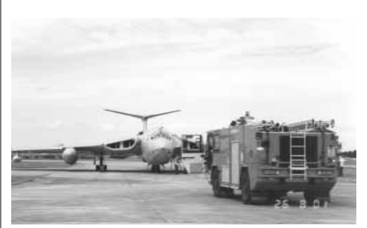
RAF Linton-on-Ouse Defence Fire Services (DFS) Alvis Rapid Intervention Vehicle (RIV) and Victor Wheel Brake incident at Elvington Airshow 26 August 2001