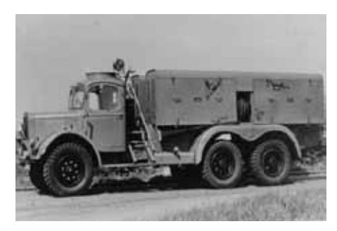
Austin Co<sup>2</sup> Gas Truck