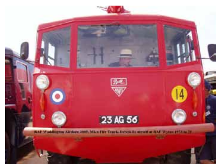
23 AG 56 at Waddington Airshow 2005