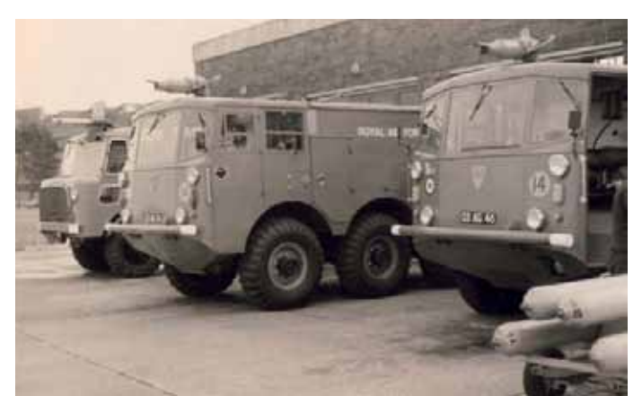
23AG 56 AT RAF Wyton 1973