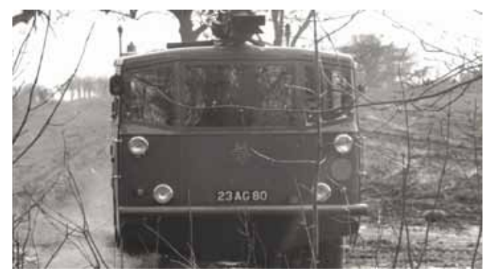
A Mk6 On RAF Catterick Rough Course

The Mk6 crash truck was built on an Alvis Salamander fighting vehicle chassis, with a Rolls Royce B81 engine, 8 cylinders in line, 237bhp @4,000rpm. The foam producing equipment was similar to that of the Mk5A. Other equipment was added such as a built in co2 fire extinguisher system for the truck and a BCF fire extinguishing system for aircraft fire fighting