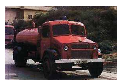
Bedford Water Bowser